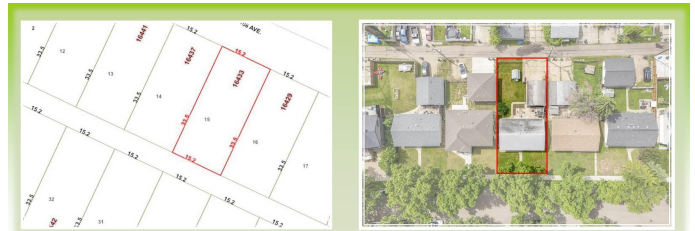
50' X 110' LOT ~ IN BRITANNIA