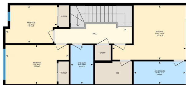
0 3 6 ft PREPARED: 20250410

2nd Floor Exterior Area 722.85 sq ft Interior Area 660.85 sq ft