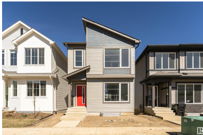
5136 Kinney Wy, Edmonton, AB

Main Floor Exterior Area 1088.95 sq ft Interior Area 625.65 sq ft